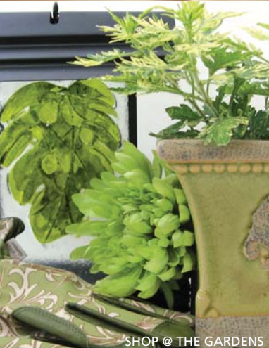
SHOP @ THE GARDENS