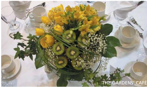
THE GARDENS' CAFÉ