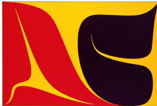
Robert Davidson, Xyaalang (Dancing) 2013, acrylic on canvas, 101.5 cm x 152.5 cm.

Expanding the Circle: Robert Davidson and the Ancient Language of Haida Art On view to May 28, 2017