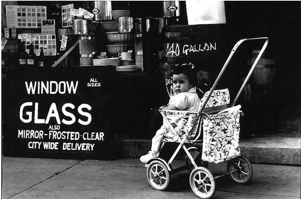
Jack Whorwood, James Street South , n.d. black and white photograph. Collection of the artist

On view June 22 - November 11, 2018 #AGHLivingRoom