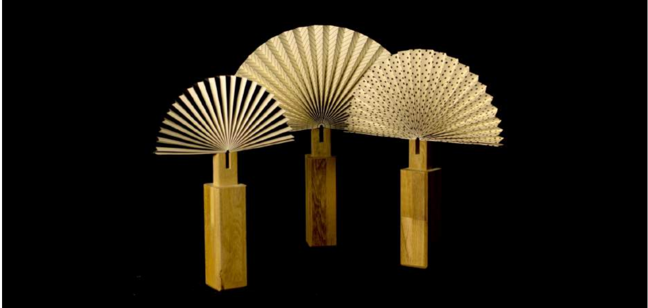
Lesley Loksi Chan (Canadian b. 1978), LAPS (production still), 2017, HD video, 14 minutes.

Hamilton Now: Subject is the first of two exhibitions inspired by the deep roots of culture and creativity in Hamilton and the recent influx of so many more artists to the city. The exhibition features the work of eight local artists and takes up the key aspects of who we are and how we manifest ourselves in an increasingly fractured world.