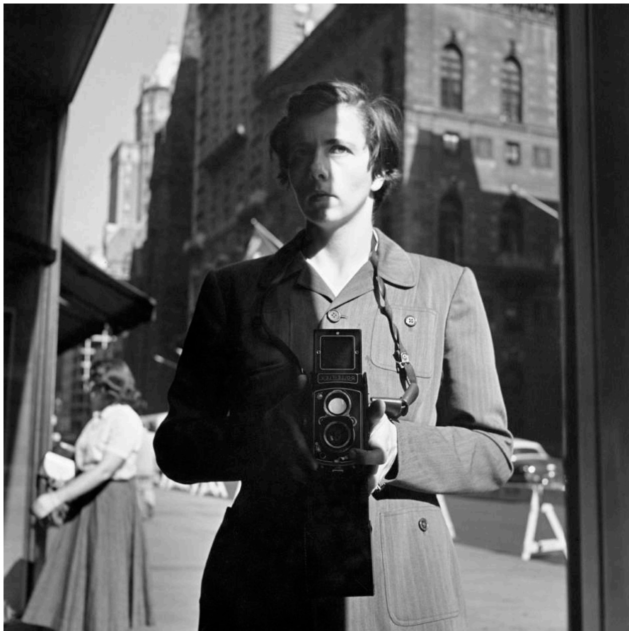
Vivian Maier (American 1926-2009) October 18th, 1953, New York, NY.

Official Exhibitions Opening: Thursday, June 21, 6 – 10 pm Free Admission