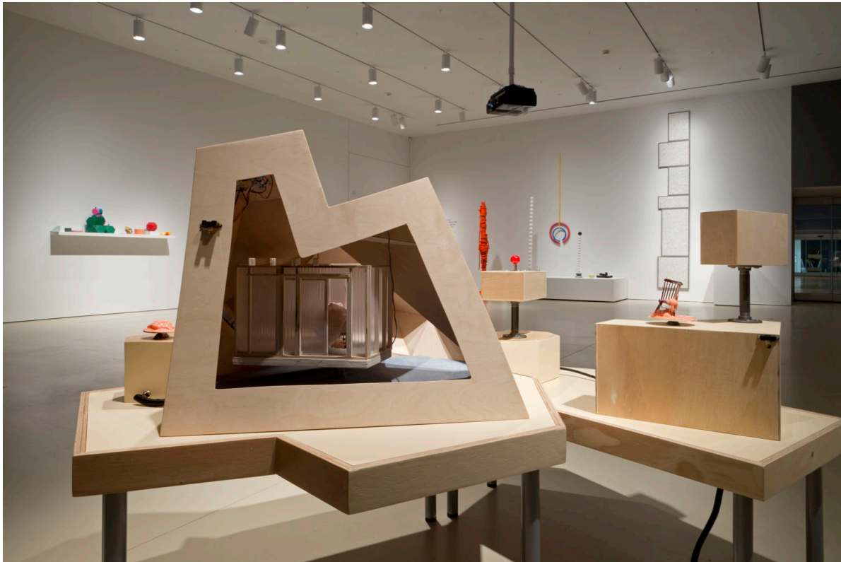
Installation image: Hamilton Now: Object featuring work by Carmela Laganse (Canadian), Debaser (detail) 2016 reclaimed wood, various materials, digital projection, hardware, Microcontrollers.

An experimental approach to sculpture and digital media, this exhibition is a statement on the incredible number of artists working in Hamilton, including many who are newly arrived to the city. The second of two parts, Hamilton Now: Object focuses mainly on sculptors. This large group exhibition offers fresh experiences of various material and conceptual approaches to the medium. Works include architectural explorations of place, hybridized clay sculptures, textile works and an interactive digital video project that incorporates a sculptural map of Hamilton.