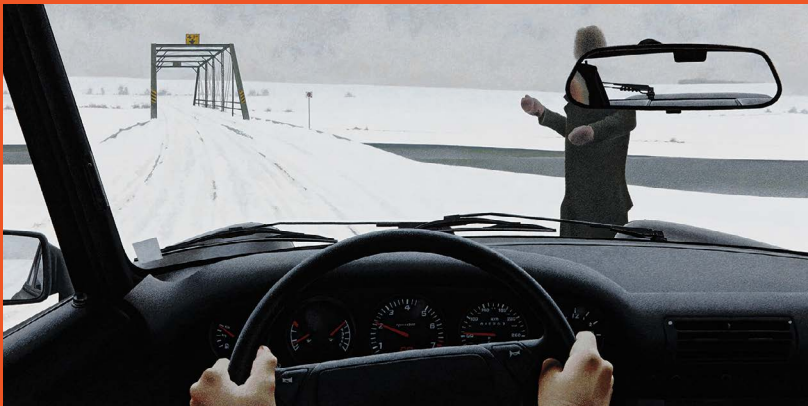
Alex Colville (Canadian 1920-2013), The Traveller , 1992, acrylic polymer emulsion on masonite. Anonymous bequest, 2014.