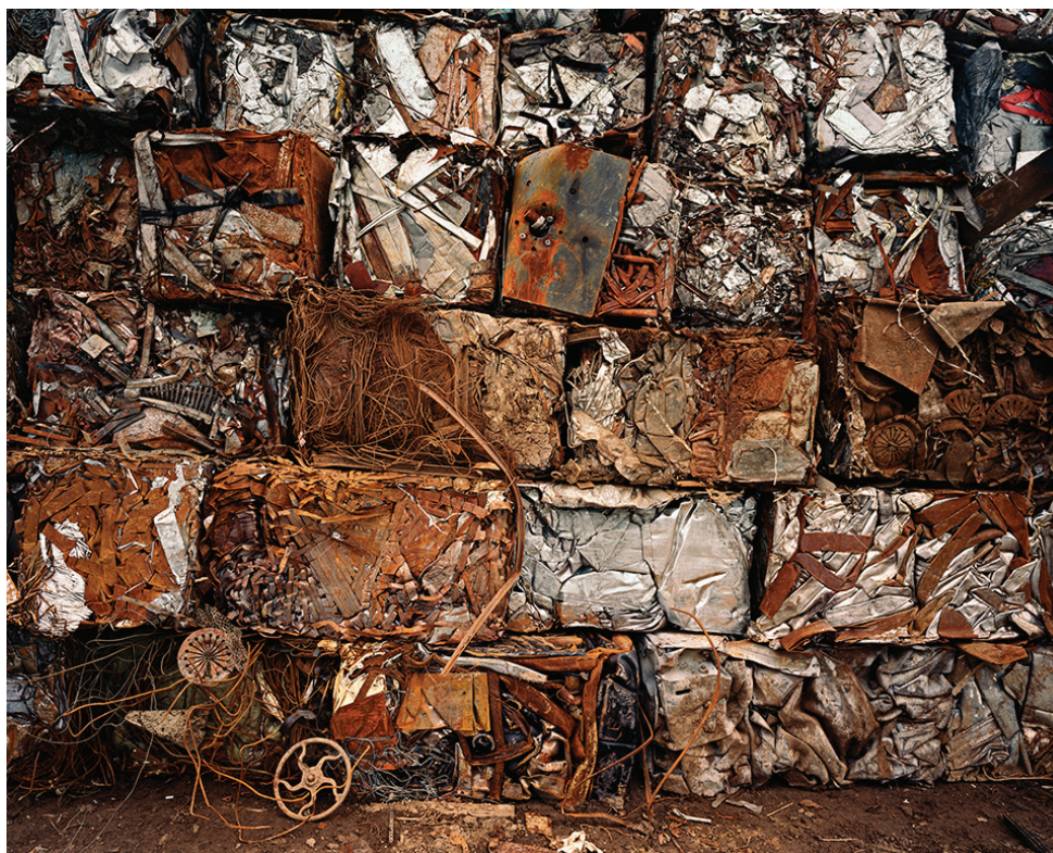
Edward Burtynsky (Canadian b. 1955) Densified Scrap Metal #3a, #3b, Hamilton, Ontario, Canada 1997 chromogenic colour prints Art Gallery of Hamilton, Gift of the artist, 2015