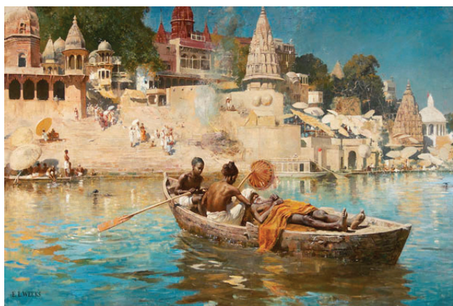
Edwin Lord Weeks (American 1849-1903) The Last Voyage-Souvenir of the Ganges c.1885 oil on canvas Art Gallery of Hamilton, The Joey and Toby Tanenbaum Collection, 2002