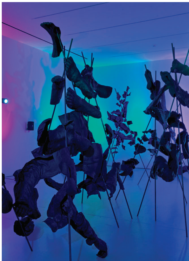
Hadley+Maxwell When That was This (detail) 2015 cinefoil, steel, magnets, 6-channel sound, LED light-programming dimensions variable 20:54