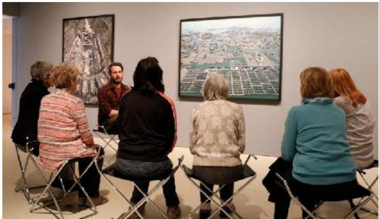
Image, top right: Installation view of Witness: Edward Burtynsky , 2018. Image, above: Installation view of Witness: Edward Burtynsky , 2018.