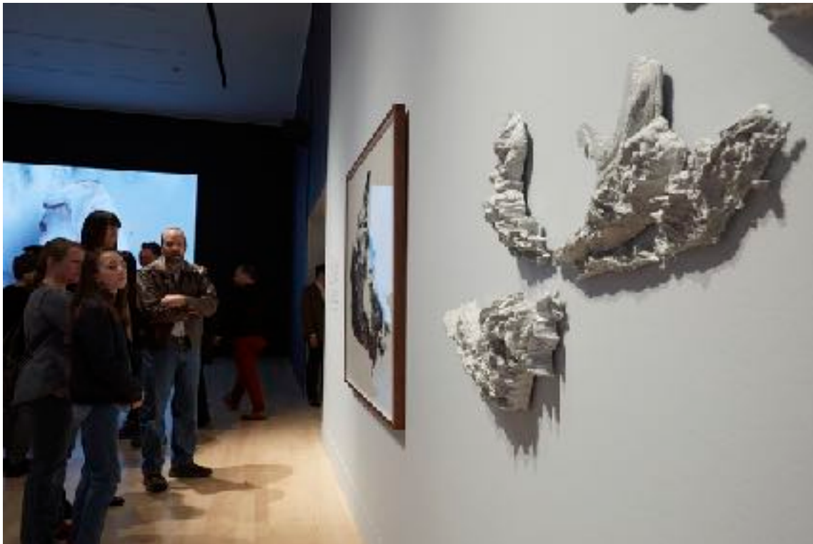
Image, top right: Installation view of Water Works , 2018.